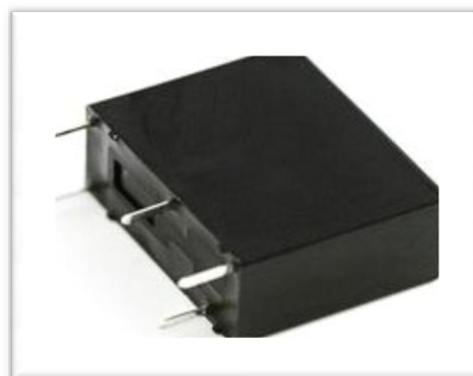
Figure 5: Relay

A relay is electrically operated switch. Many relays use an electromagnet to operate a switching mechanism mechanically, but other operating principles are also used. Relays are used where it is necessary to control a circuit by a low-power signal (with complete electrical isolation between control and controlled circuits), or where several circuits must be controlled by one signal. A relay is an electrically operated switch. Current flowing through the coil of the relay creates a magnetic field which attracts a lever and changes the switch contacts. The coil current can be on or off so relays have two switch positions and most have double throw (changeover) switch contacts as shown in the diagram. Normally Open (NO): Contacts connect the circuit when the relay is activated, the circuit is disconnected when the relay is inactive. Normally Closed (NC): Contacts disconnect the circuit when the relay is activated, the circuit is connected when the relay is inactive. Change Over (CO): It's the common contact. Coil: It's the electromagnet coil inside relay. Coil rating: It's the Voltage at which the coil gets fully activated. Some also have coil resistance mentioned on them. Relay coil voltage rated 6V and 12V are the most commonly available.