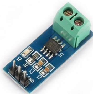
Figure 3: Current Sensor

Current sensors are based on either open or closed loop hall effect technology. A closed-loop sensor has a coil that is actively driven to produce a magnetic field that opposes the field produced by the current being sensed. The hall sensor is used as a null-detecting device, and the output signal is proportional to the current being driven into the coil, which is proportional to the current being measured.