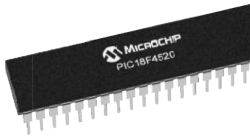
Figure 2: PIC18f4520