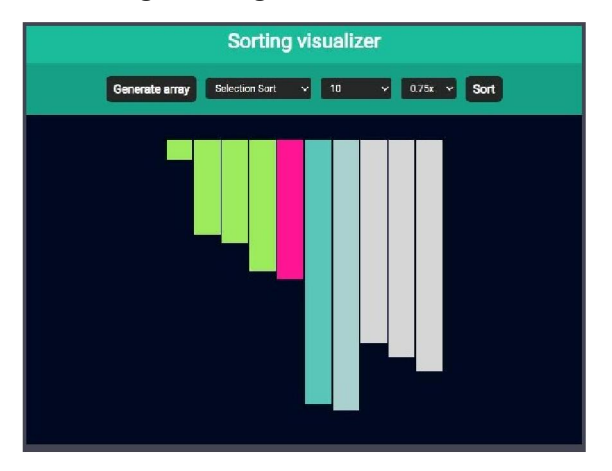
Fig: Showing Selection Sort