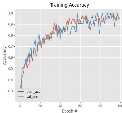
ACCURACY OF THE MODEL

The above figure shows the developed model. Where we will input the image then that image will be displayed after this will be given as input to model there by it predicts for the above image as tumor is in Stage 3