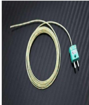
Fig.2. K-type thermocouple