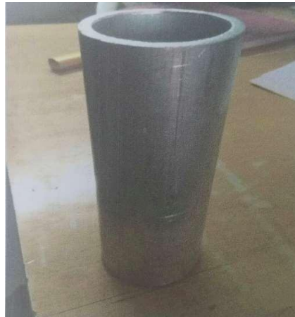
Fig.4.Fabricated External Cylinder