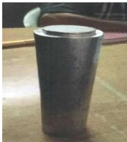
Fig.3. Fabricated Internal Cylinder