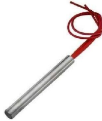
Fig.1. Cartridge Heater