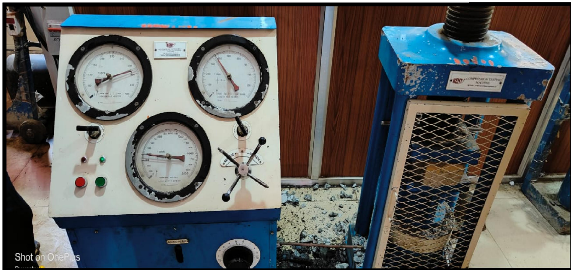
Fig2. Paving block Testing