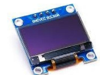
Fig. 8 OLED Display