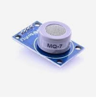
Fig.6 MQ7 Gas Sensor