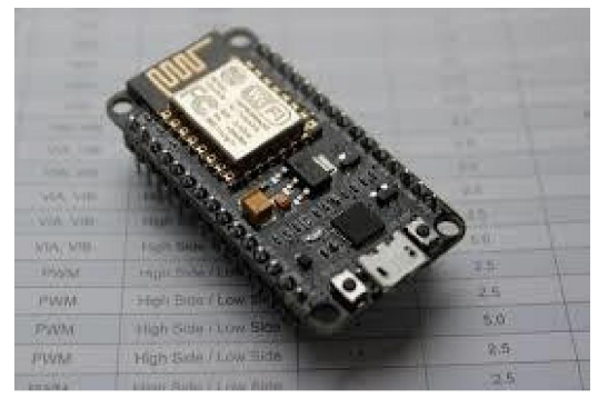
Fig. 2 Node MCU

key advantages of NodeMCU is its support for the Lua scripting language, which simplifies the development of IoT applications by providing a high-level programming interface. Additionally, NodeMCU is compatible with the Arduino IDE (Integrated Development Environment), allowing users familiar with Arduino programming to transition seamlessly to the ESP8266 platform. Overall, NodeMCU is a versatile and cost-effective solution for building IoT projects, offering the necessary hardware and software capabilities tobring ideas to life in the rapidly growing field of connected devices and smart systems