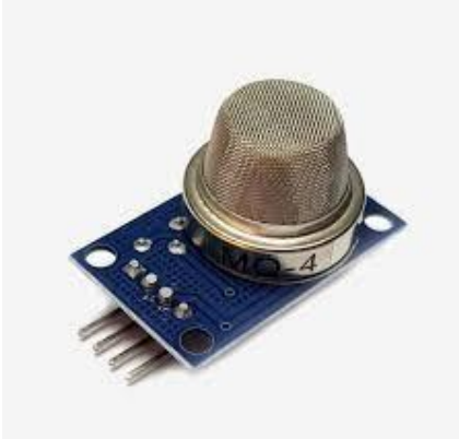
Fig.4 MQ4 Sensor