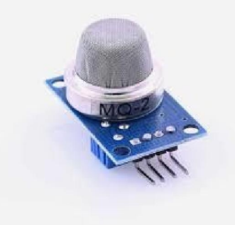
Fig.3 MQ2 Gas Sensor DOI: 10.48175/568